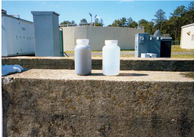
Influent & Effluent Samples at Brookhaven National Lab, Upton NY

When operators fail to perform their required duties properly or when the treatment plants have several inspections that note repeat violations, the owner, the operator and the engineer of record are required to attend a compliance meeting. During the meeting, a review of the plant deficiencies is made and certain required operational corrections are made compulsory. Reinspections of the treatment plant are performed to determine if the deficiencies have been corrected. In extreme instances of operator malfeasances, the NYSDEC can revoke an operator's certification. This has happened to an operator in Suffolk County.