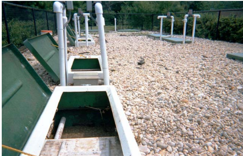
Cromaglass Treatment Plant at Greenview Court Oakdale NY

Cromaglass is a trade name for a specialized sewage treatment plant. Its design is based on the same technology as the SBR except it utilizes venturic pumps instead of aeration blowers for aeration. The process is designed to meet the needs of small communities and must have a design flow of less than 15,000 gallons per day. All Cromaglass systems installed in Suffolk County have an equalization pumping station and a splitter box located prior to the treatment trains. Currently there are 28 Cromaglass plants on line in Suffolk County and approximately another 12 either are under construction or are under review by SCDHS. Just like the SBR, Cromaglass has proven to be a viable technology. When designed and operated properly it consistently puts out an effluent less than 10 mg/l total nitrogen.