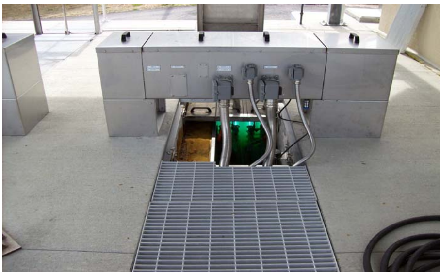
UV Disinfection at SCSD #1 Port Jefferson NY

Currently, two methods of disinfection are utilized by treatment plants in Suffolk County: chlorination and ultraviolet radiation (UV). UV disinfection is replacing chlorination because of the environmental problems associated with chlorination noted above and because they offer economic and potential safety advantages.